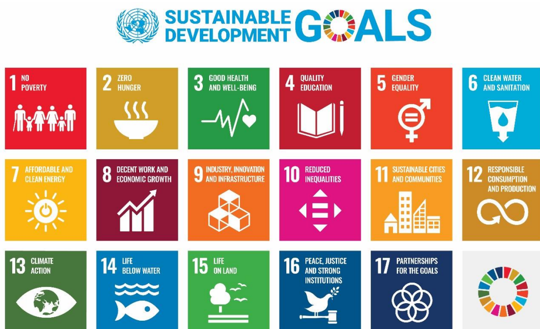
Figure 2: "OUR CONTRIBUTION TO THE 17 SDG GOALS OF THE UNITED NATIONS"

In its sustainability strategy paper, PROLICHT commits to aligning its corporate actions and thinking with the United Nations' 17 Sustainable Development Goals.